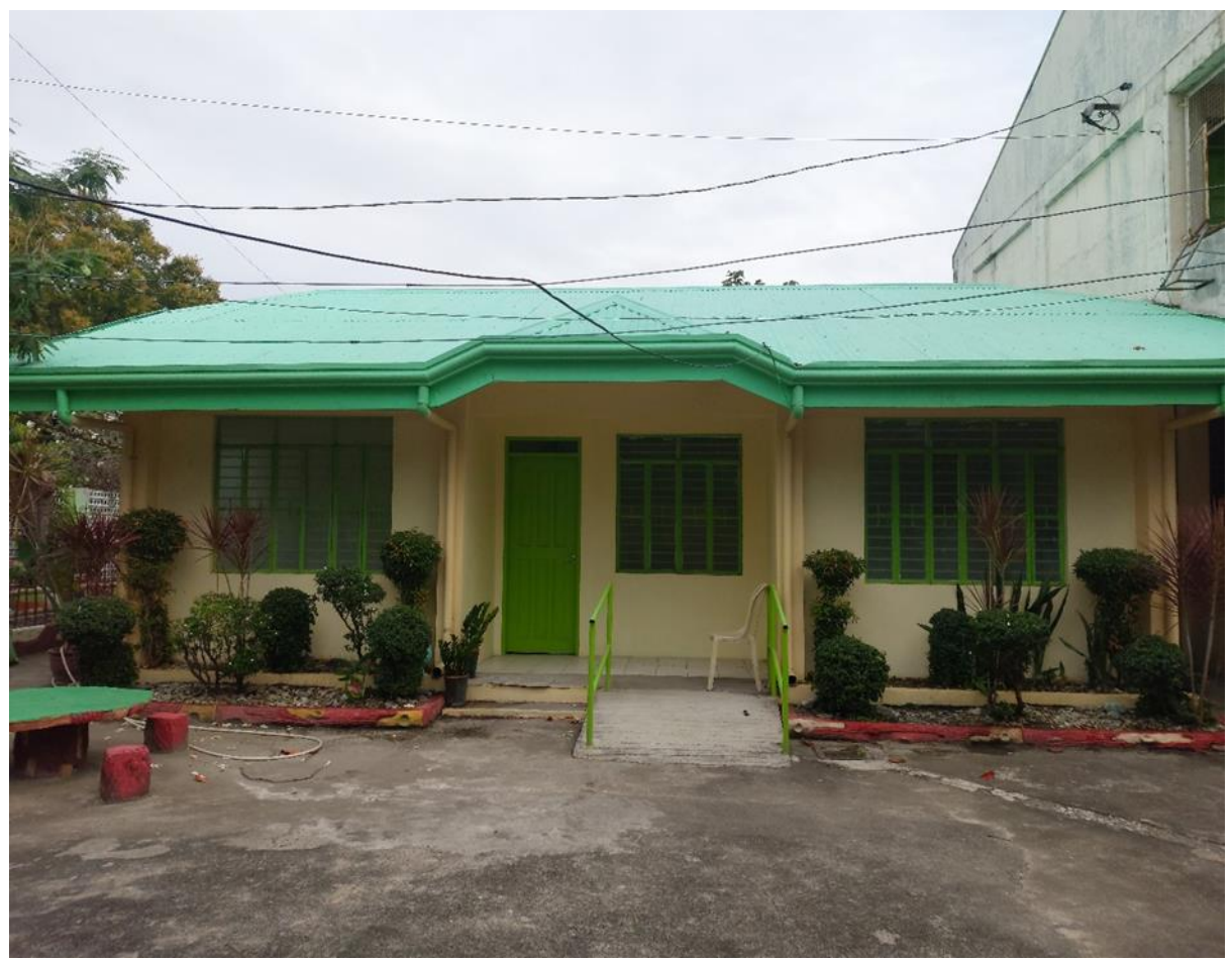
HOME ECONOMICS BUILDING (VIOLAGO TYPE) (1997)

REGION III – CENTRAL LUZON DIVISION OF SCIENCE CITY OF MUNOZ MUÑOZ NORTH CENTRAL SCHOOL